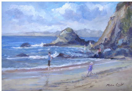
The Pink Dress, Polkerris, Cornwall

Please complete and return the attached booking form.