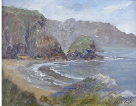
Camel Rock, Cornwall

email: art@melaniecambridge.com tel: 0208 660 4982