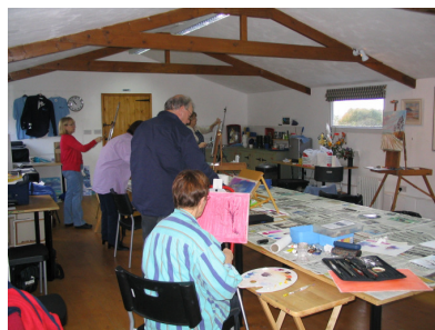
Students enjoying a workshop session in the studio

Course includes an excellent home cooked lunch with free tea and coffee available all day. Accommodation is extra. Please ask me for a list of local B&Bs.